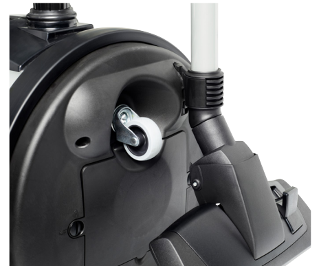
Parking solution as standard