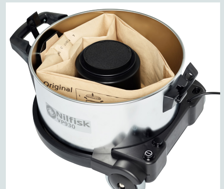
Durable steel container and 15 litre dust bag