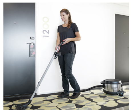
VP930 is specially built for noise sensitive areas with a low comforting background sound pressure level from only 53 dB(A)