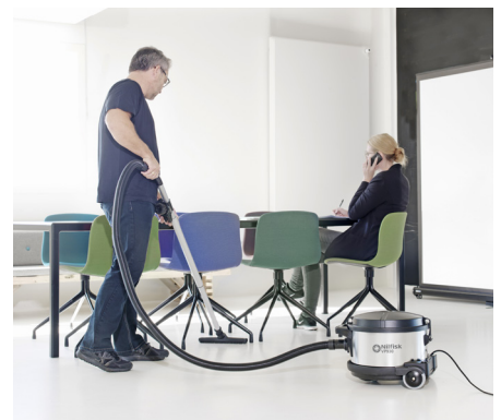
The VP930 is the perfect choice for demanding applications such as offices, hotels and public buildings