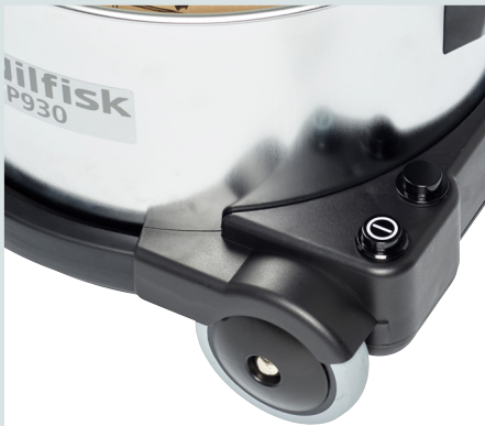
Dual speed function on selected variants