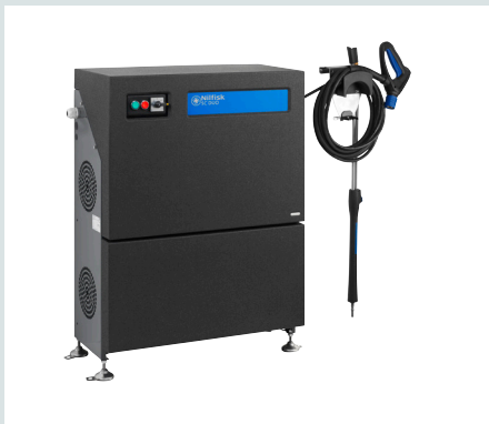
Accessory storage kit