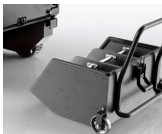
Wheeled hopper with optional mini containers