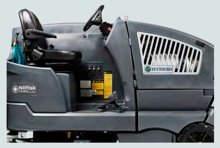
The CS7010 has a fully adjustable seat and tilt steering