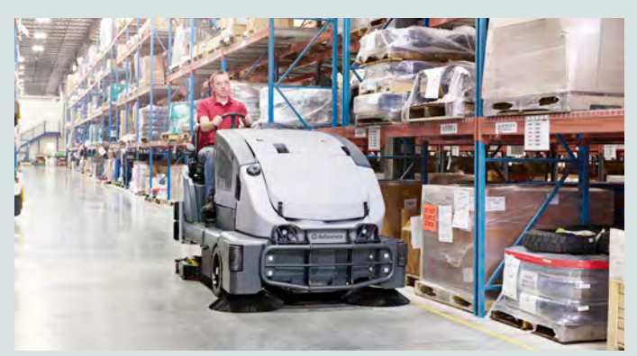
SmartFlow<sup>™</sup> adjusts solution flow with the machine's speed, using water and chemicals. Proportionally higher productivity with fewer dump and refill cycles per tankful