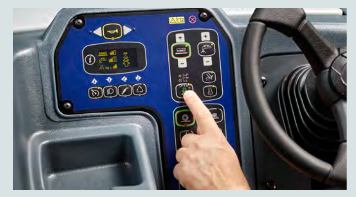
Intuitive controls with OneTouch<sup>™</sup> operation reduce training time, improve productivity and deliver more consistent cleaning results