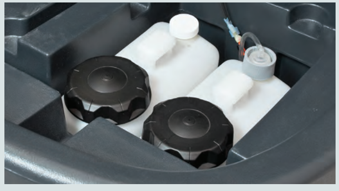
EcoFlex<sup>™</sup> System with interchangeable dual detergent cartridges are refillable with your favorite brand of detergents